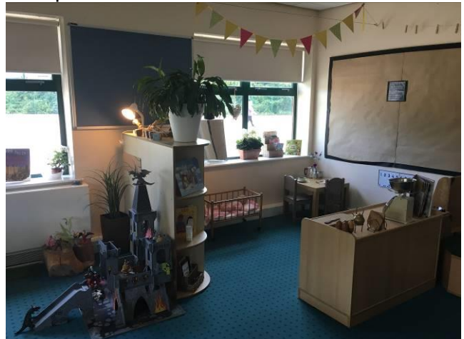
Reception 1 home corner and small world