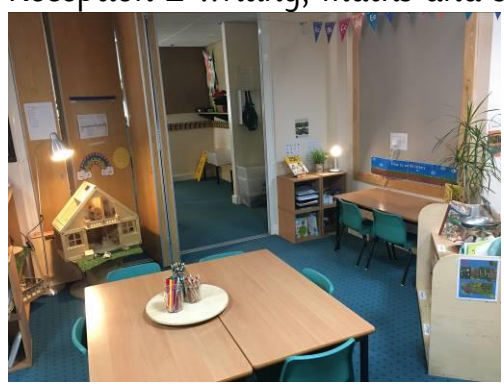
Reception 2 writing, maths and small world