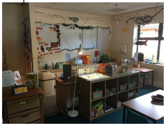
Reception 1 maths area and studio