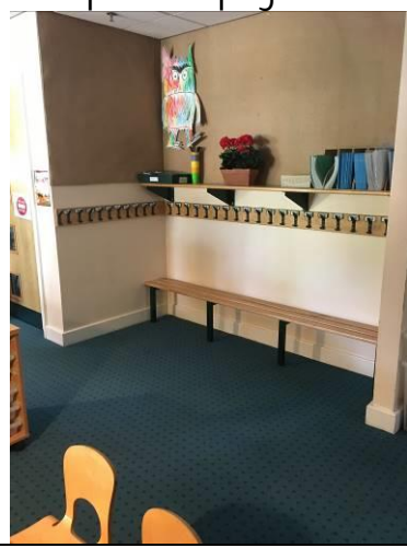
Reception 1 pegs