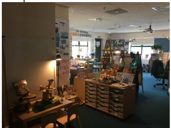
Reception 1 small world