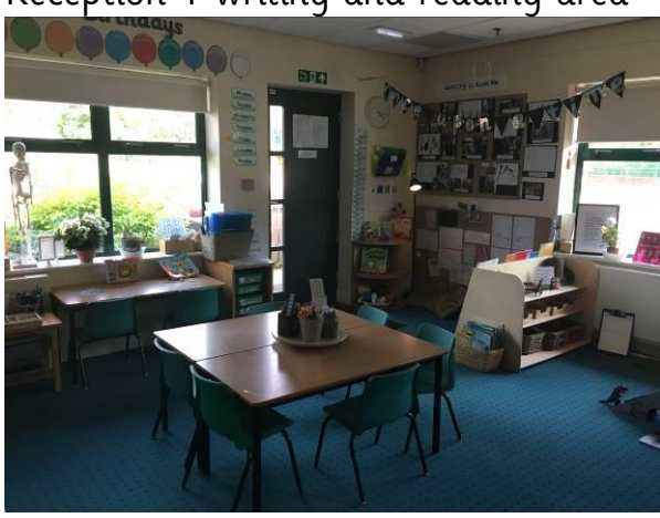
Reception 1 writing and reading area