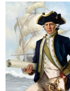
Captain James Cook 1729 -1779

The weather and temperature over a long period of time