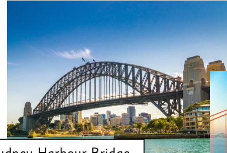
Sydney Harbour Bridge