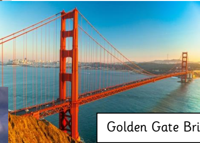
Golden Gate Bridge