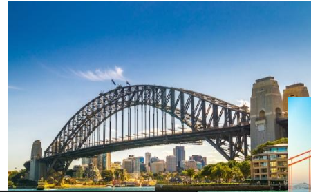
Sydney Harbour Bridge

An architect is a skilled professional who plans and designs buildings and plays an important role in their construction.